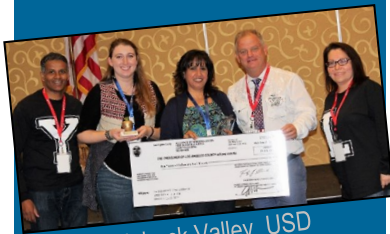
Saddleback Valley USD

Facebook, Twitter, Instagram, Snapchat, and more... Adults and youth today regularly interact with friends, and strangers, through a seemingly unlimited array of social networking sites. This means of communicating provides increased opportunities for sexual abusers to communicate with their intended victims. Recognizing this risk, organizations have a responsibility to provide guidelines for how their employees and program participants should and should not inter-